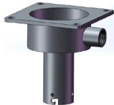
ceiling mounted bracket